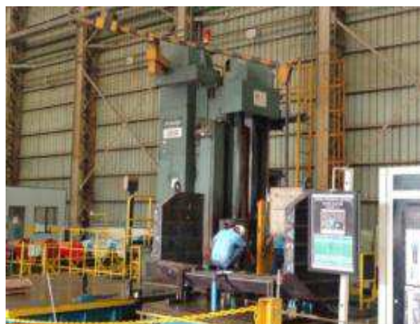
Horizontal Boring Machine TOSHIBA 150-A (L=6,000, H=2,000) mm