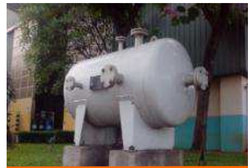
Pressure Vessel with ASME code