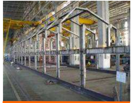
Stainless Steel Frame