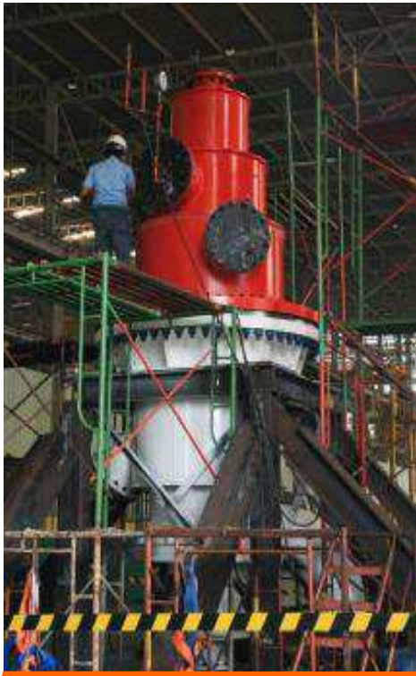
Rotating Swivel for Buoy