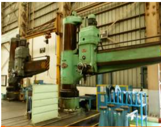
Vertical Boring Machine OKUMA 2500 & 3000