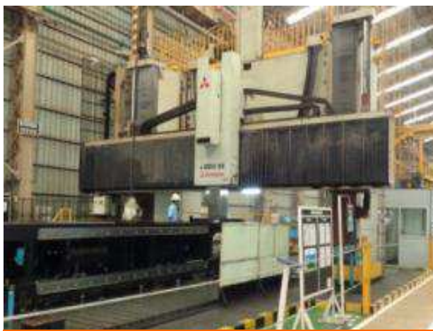
Vertical Boring Machine Mitsubishi MVR 54/60 (L=8,000, W=5,400, H=2,500) mm