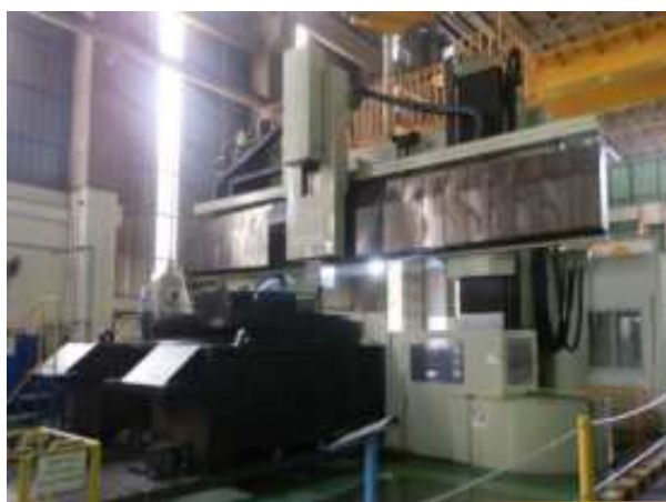
Vertical Boring Machine Mitsubishi MVR 43/49D (L=9,000, W=4,300, H=4,000) mm