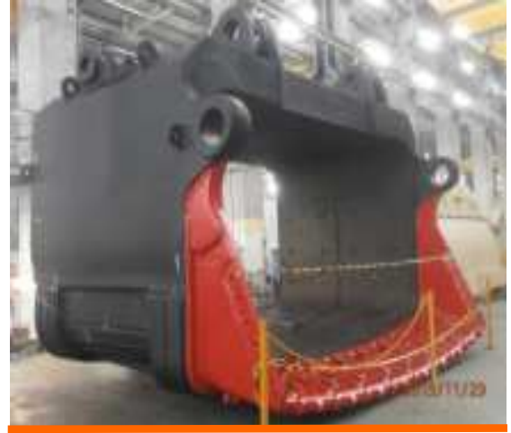
Drag line bucket