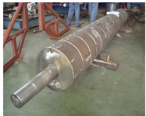
Roller for Textile industry