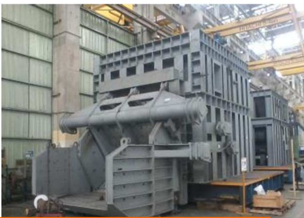
UG Truck Loading Chute