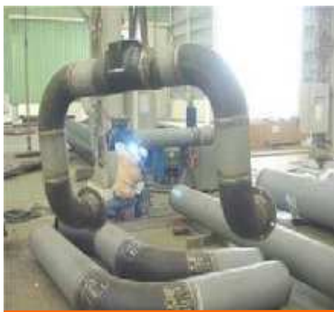
Pipe Spool Project for Caltex Welding Process GTAW+GMAW