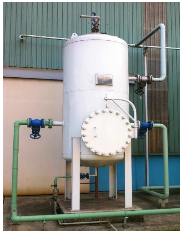
Pressure vessels with ASME stamp