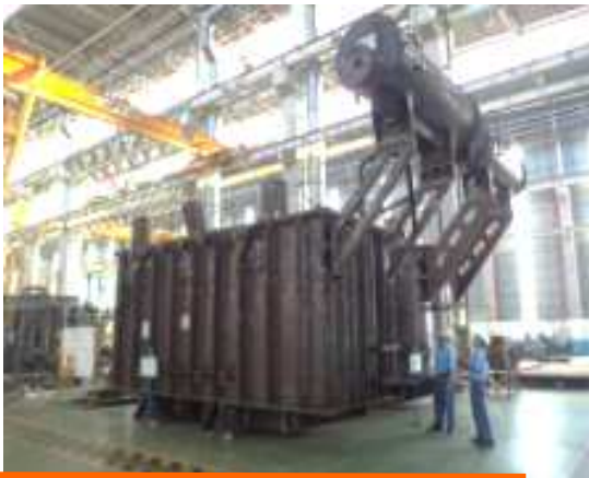
Transformer Tank – since 1994