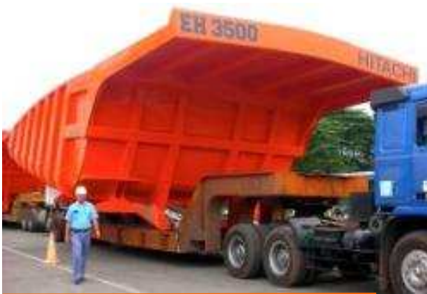
Rigid dump truck body (Customer design)