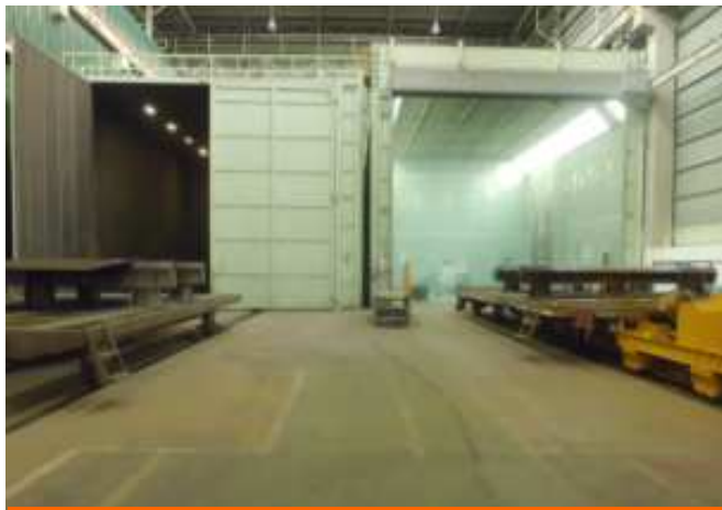
Blasting & Painting Booth - CBT2