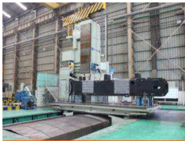
Horizontal Boring Machine Toshiba 160-L (L=6,500, H=4,000) mm