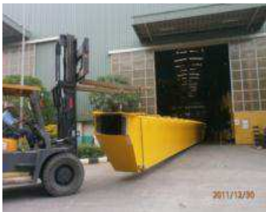
Overhead Crane – Y2011