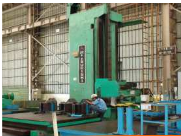
Horizontal Boring Machine MAV 200/135 (L=6,460, H=3,950) mm