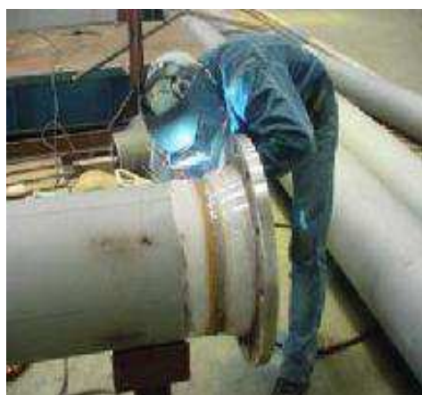
Welding Process of Pipe for Caltex