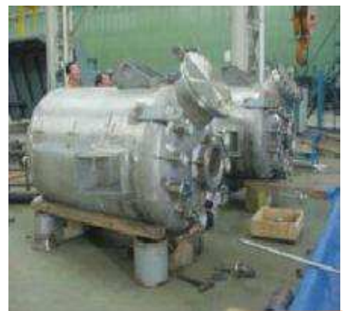
Pressure Vessel for Chemical