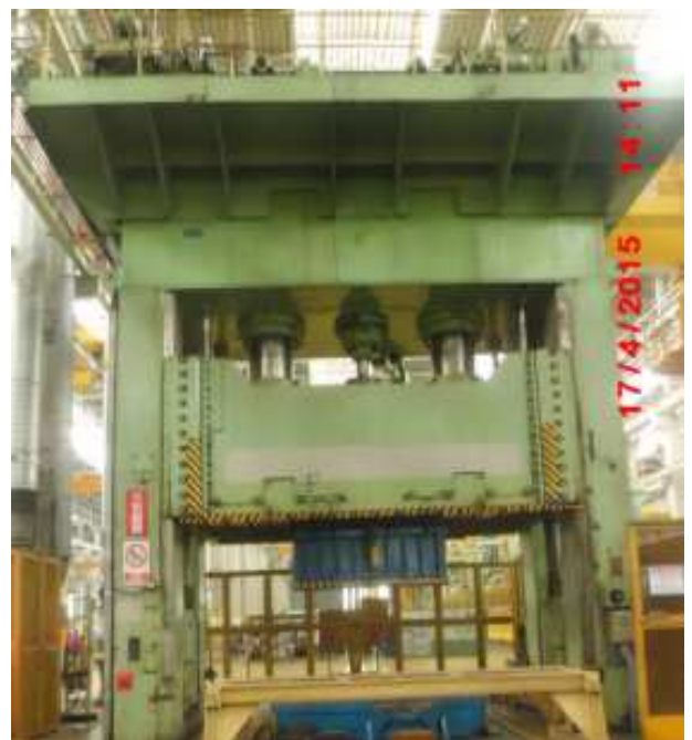
KURIMOTO Press Machine – CBT2 Cap. 2400Ton