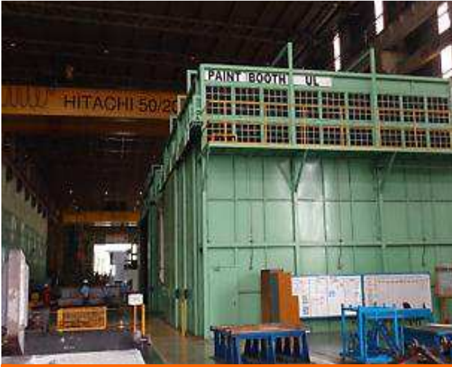
Blasting and Painting Booth - CBT1 (L=9,000, W=10,000, H=6000) mm