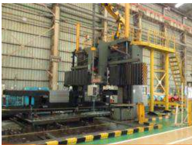
Vertical Boring Machine Mitsubishi MVR 38/40 (L=7500, W=3,800, H=1,950) mm