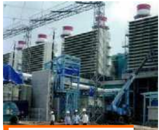
Air intake Filtration System and Exhaust Silencer – CCPP Muara Tawar II - 2004