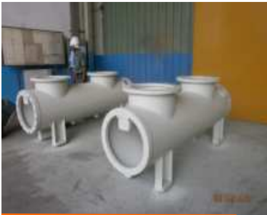
GIS (Gas Insulated Switchgear) Tank