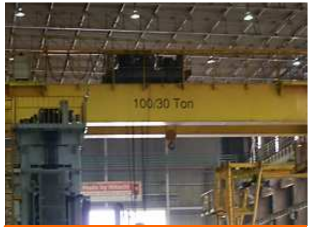
Overhead Crane Capacity 10 Ton ~ 100 Ton