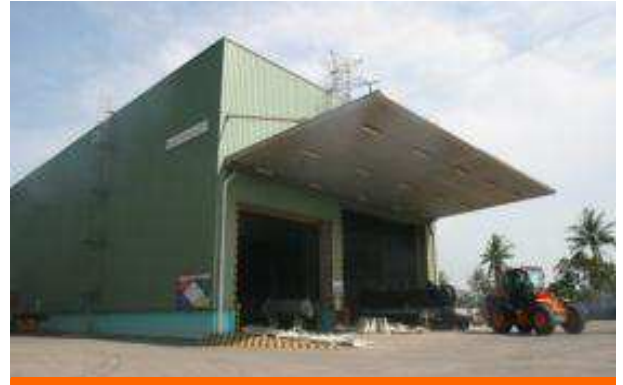
Trailer Painting Booth – CBT1 Room 1 : (L=13,700, W=6,800, H=6000) mm Room 2 : (L=18,500, W=10,000, H=8000) mm